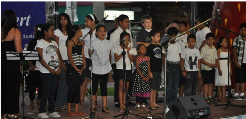
Emmanuel Junior Youth performing at the recent Gospel Peace Concert.